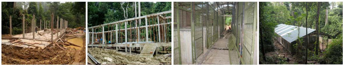
Progress of the new bear house construction from July – December 2009.

Fencing. The construction of the perimeter fencing using existing belian, as well as the chainlink fencing between the 4 large and 2 small forest enclosures, was also slightly delayed due to rains. It was 40% complete by the end of 2009. The deadline for completion was extended to February 2010, after which hot-wiring (the installation of an electric fence), will be carried out by a specialized contractor to prevent bears from escaping from their outdoor enclosures.