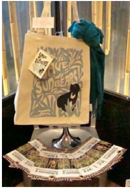
Tote bag with a sun bear motif.

awareness about sun bears in the US. The bags were sold during a one-day sale in her office and also may be ordered by e-mail. All proceeds are donated to BSBCC.